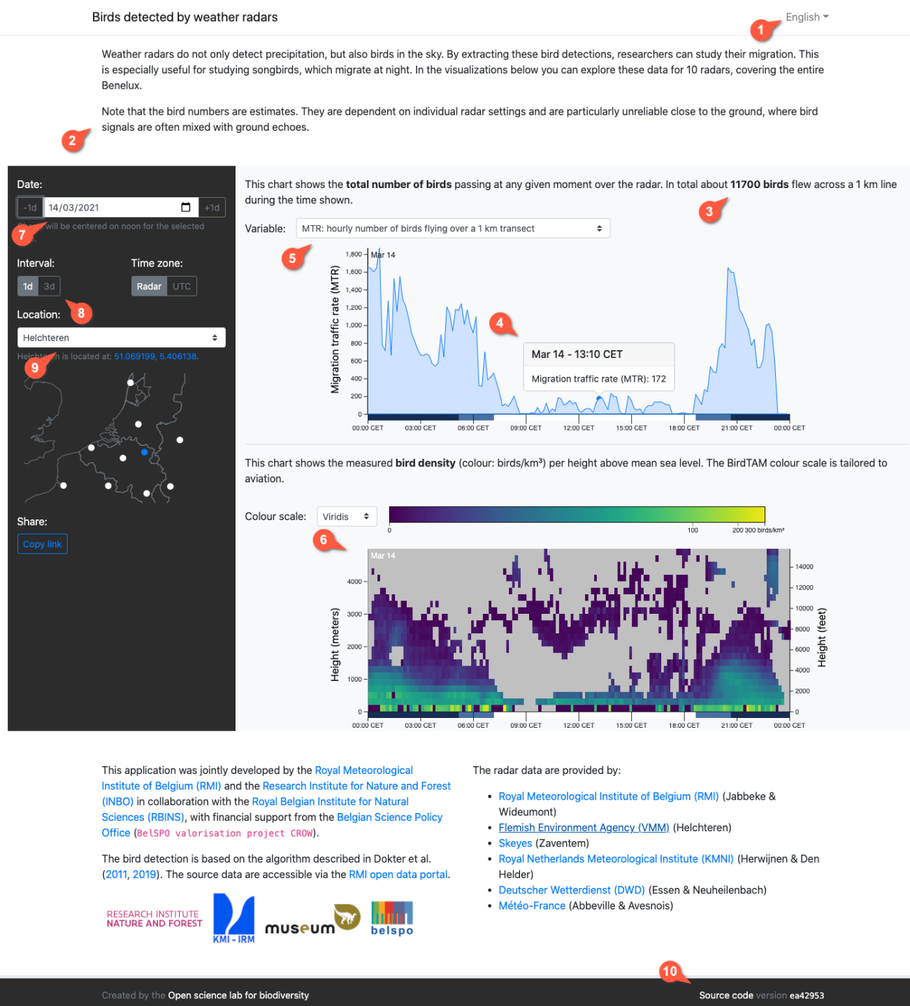
Figure 2. Screenshot of the developed web app. The following elements are highlighted: 1 language selector (OBJ-2.2), 2 short and accessible introductory text, 3 indicative number for the total bird mass shown on the chart (OBJ-2.3), 4 detailed data exploration via tooltip (OBJ-2.4), 5 several bird quantities are available, default “MTR”, 6 density chart showing the vertical distribution of the birds (OBJ-2.4), 7 date selector (OBJ-2.5), 8 choice between chart generation for 1 or 3 days (OBJ-2.3), 9 radar selector via drop-down or via map (OBJ-2.3), 10 link to the source code on GitHub (OBJ-2.6).