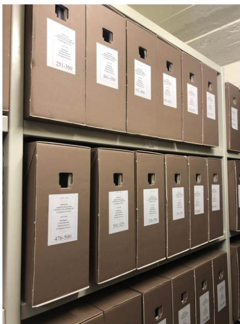
Figure 3. Military courts records boxes at the National Archives 2 - Joseph Cuvelier repository

After their repackaging, the material scope of the archives is of 194 record boxes for 27 linear metres, distributed as follows: