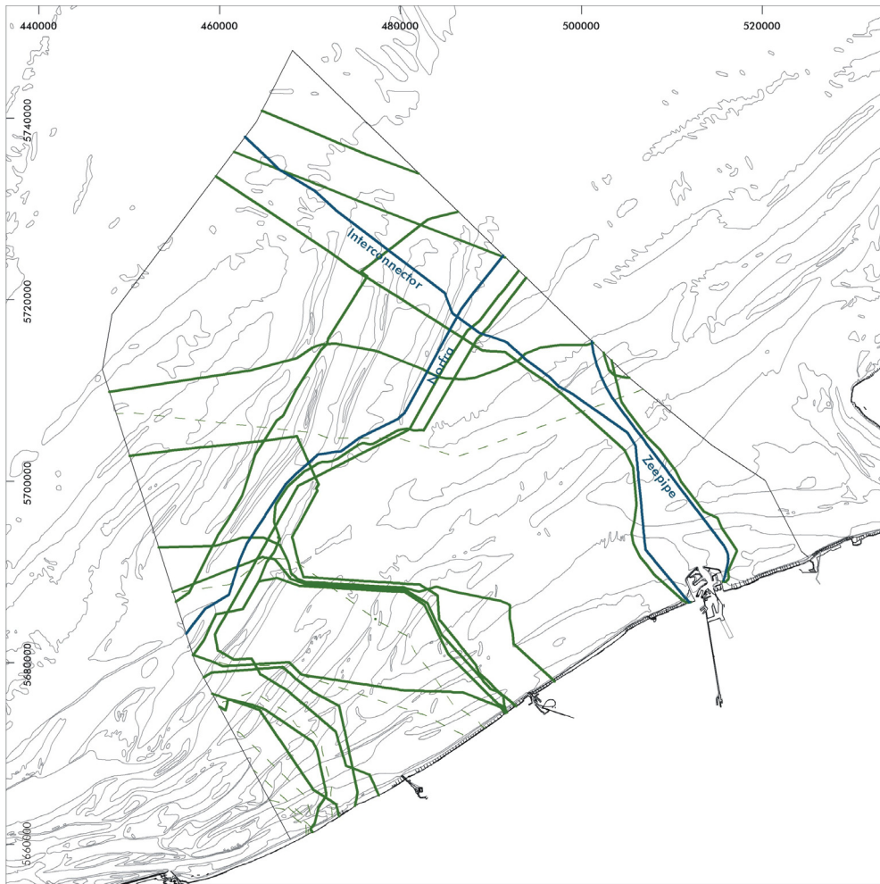
Map I.2.1a. Cables and pipelines: spatial distribution