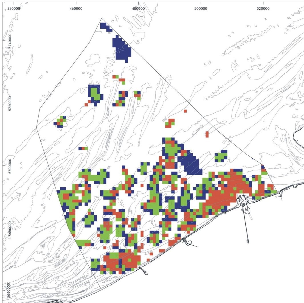
Map I.3.9a. Recreation and tourism at sea (recreational fisheries): spatial distribution and use intensity

Use intensity of recreational fishing at sea (relative number of observed recreational fishing vessels/year/km 2 )