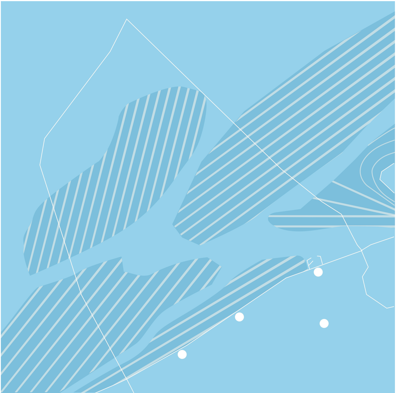
Map III.1.2.1e. Groups of sandbanks (Structure map: Maritime Institute - Gent University)